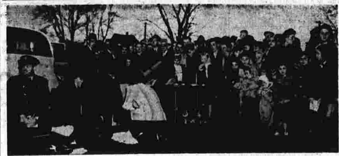
The First Aid Unit of Civil Defense display demonstrated five different types of casualties on living models Sunday afternoon...